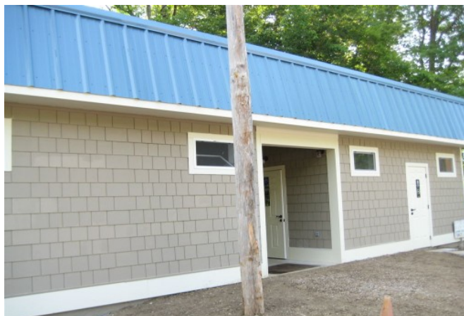
Parting Shot: The New Bath House at Watauga Lake